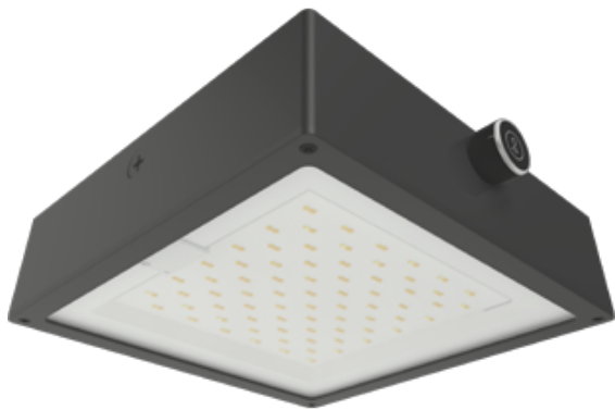
Color: Bronze Weight: 6.2 lbs