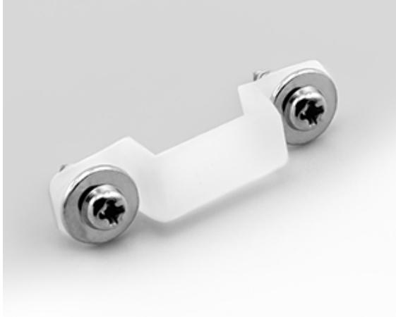
Weight: 0.1 lbs