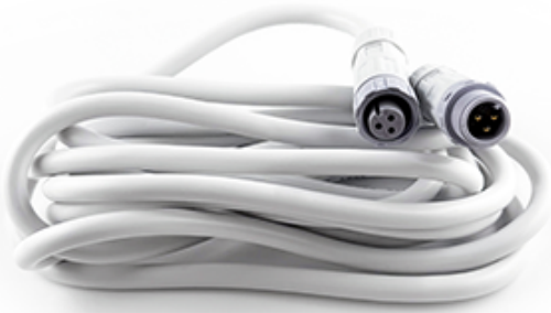
Weight: 0.3 lbs