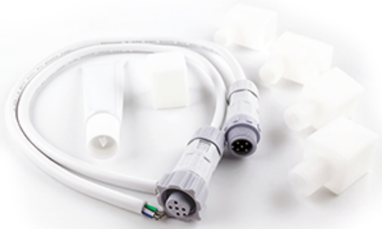
Weight: 0.2 lbs