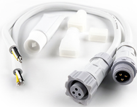
Weight: 0.1 lbs