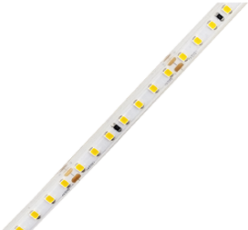
Weight: 0.9 lbs