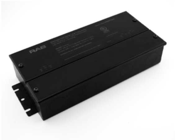
Weight: 2.6 lbs