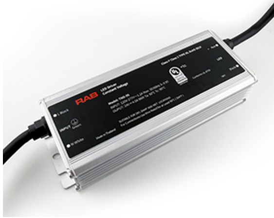
Weight: 1.8 lbs