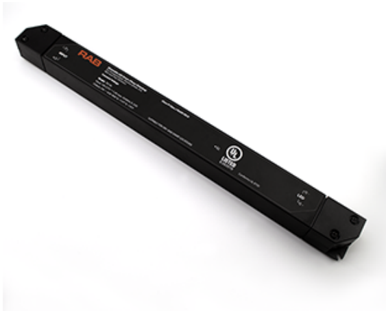
Weight: 0.7 lbs