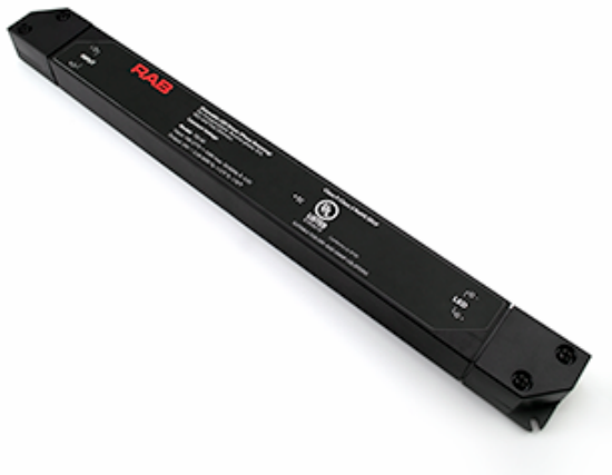
Weight: 0.6 lbs