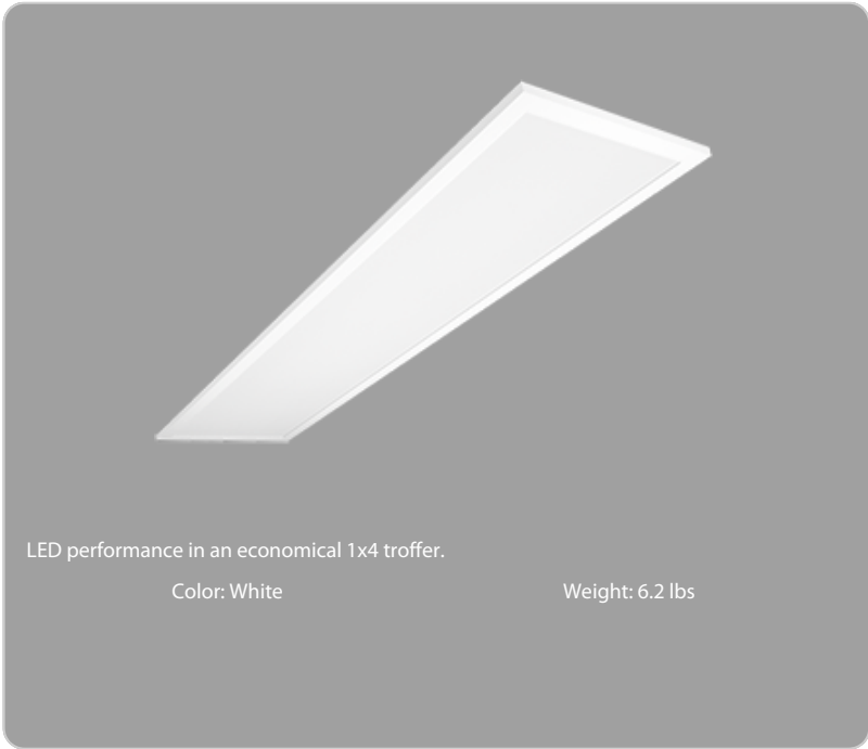
LED performance in an economical 1x4 troffer. Color: White Weight: 6.2 lbs