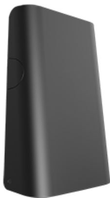
Color: Bronze Weight: 2.0 lbs