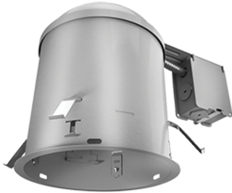
Weight: 1.2 lbs