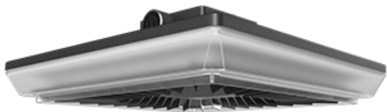
Color: Bronze Weight: 0.0 lbs