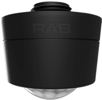
Color: Black Weight: 0.0 lbs