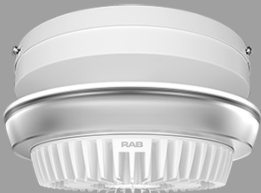
Color: White Weight: 2.9 lbs