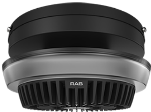
Color: Bronze Weight: 2.9 lbs