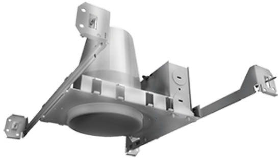
Weight: 1.8 lbs