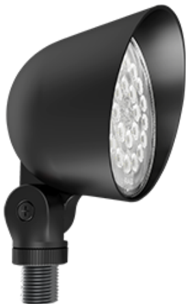
Color: Bronze Weight: 1.1 lbs