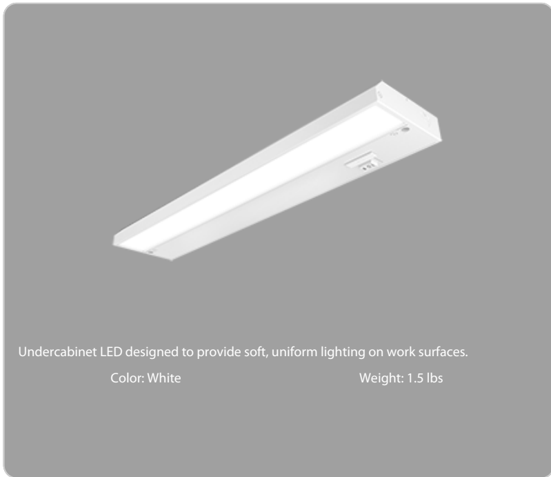
Undercabinet LED designed to provide soft, uniform lighting on work surfaces.