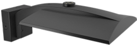
Low profile, low glare. Edge-lit technology unlike any other. Color: Bronze Weight: 20.0 lbs