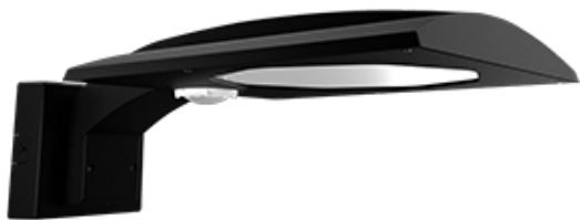
Low profile, low glare. Edge-lit technology unlike any other. Color: Black Weight: 20.0 lbs