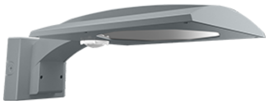
Low profile, low glare. Edge-lit technology unlike any other. Color: Gray Weight: 20.0 lbs