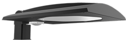
Low profile, low glare. Edge-lit technology unlike any other. Color: Bronze Weight: 13.5 lbs