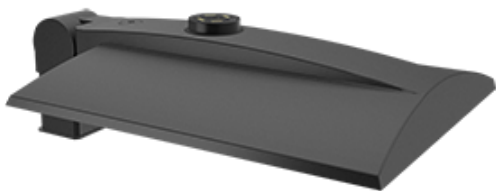
Low profile, low glare. Edge-lit technology unlike any other. Color: Bronze Weight: 13.5 lbs