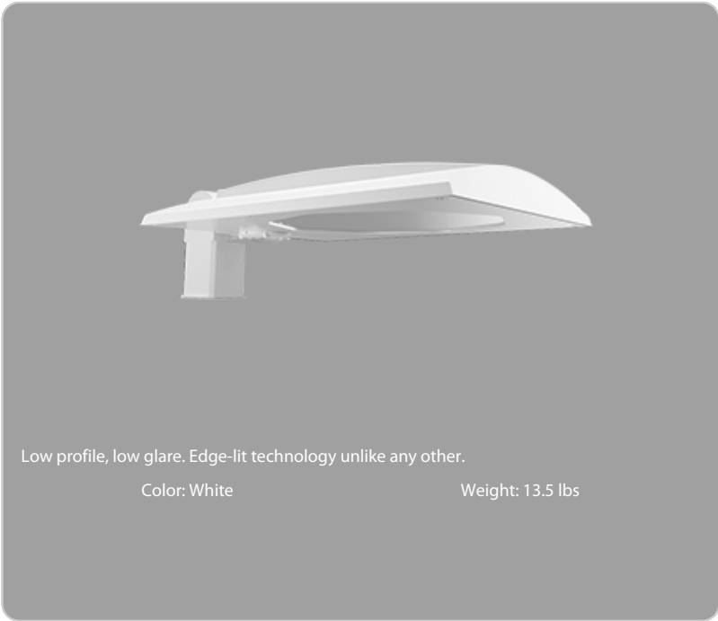
Low profile, low glare. Edge-lit technology unlike any other. Color: White Weight: 13.5 lbs