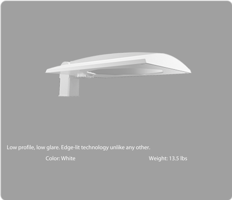
Low profile, low glare. Edge-lit technology unlike any other. Color: White Weight: 13.5 lbs