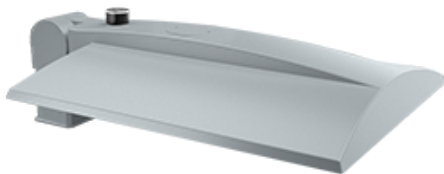
Low profile, low glare. Edge-lit technology unlike any other. Color: Gray Weight: 13.5 lbs