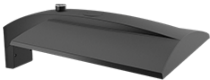
Low profile, low glare. Edge-lit technology unlike any other. Color: Bronze Weight: 15.0 lbs