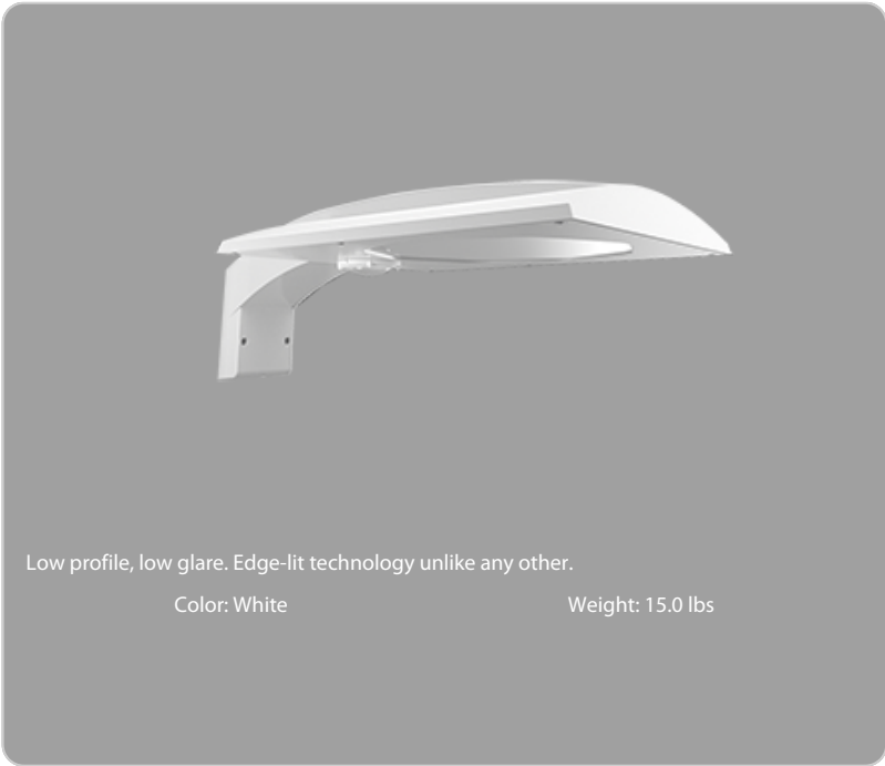
Low profile, low glare. Edge-lit technology unlike any other. Color: White Weight: 15.0 lbs