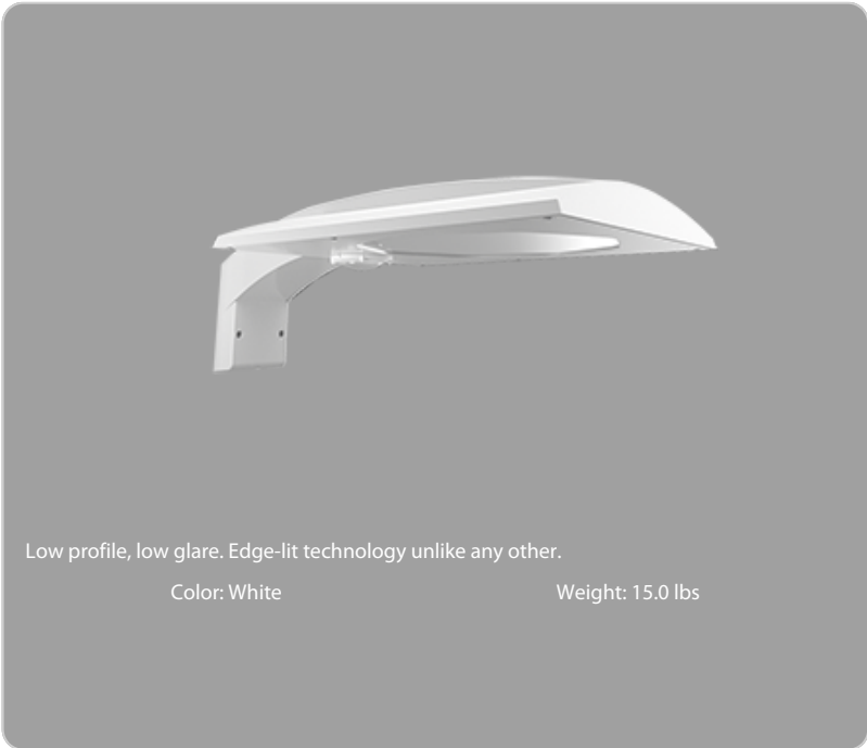
Low profile, low glare. Edge-lit technology unlike any other. Color: White Weight: 15.0 lbs