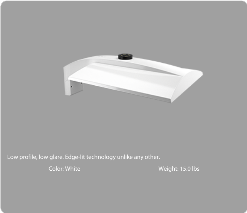
Low profile, low glare. Edge-lit technology unlike any other. Color: White Weight: 15.0 lbs