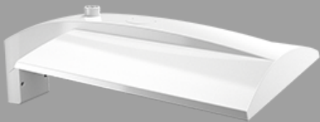
Low profile, low glare. Edge-lit technology unlike any other. Color: White Weight: 15.0 lbs