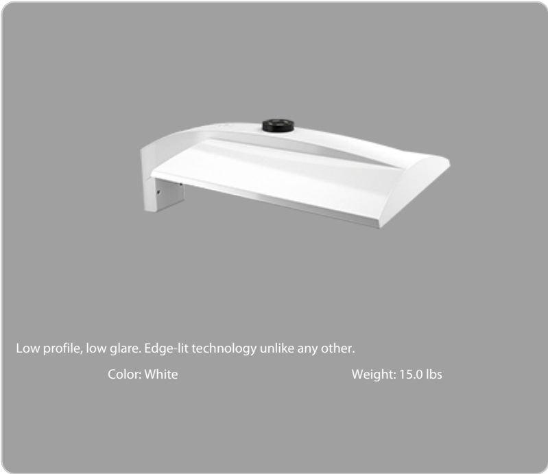
Low profile, low glare. Edge-lit technology unlike any other. Color: White Weight: 15.0 lbs