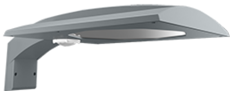
Low profile, low glare. Edge-lit technology unlike any other. Color: Gray Weight: 15.0 lbs