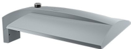
Low profile, low glare. Edge-lit technology unlike any other. Color: Gray Weight: 15.0 lbs