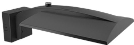
Low profile, low glare. Edge-lit technology unlike any other. Color: Bronze Weight: 20.0 lbs