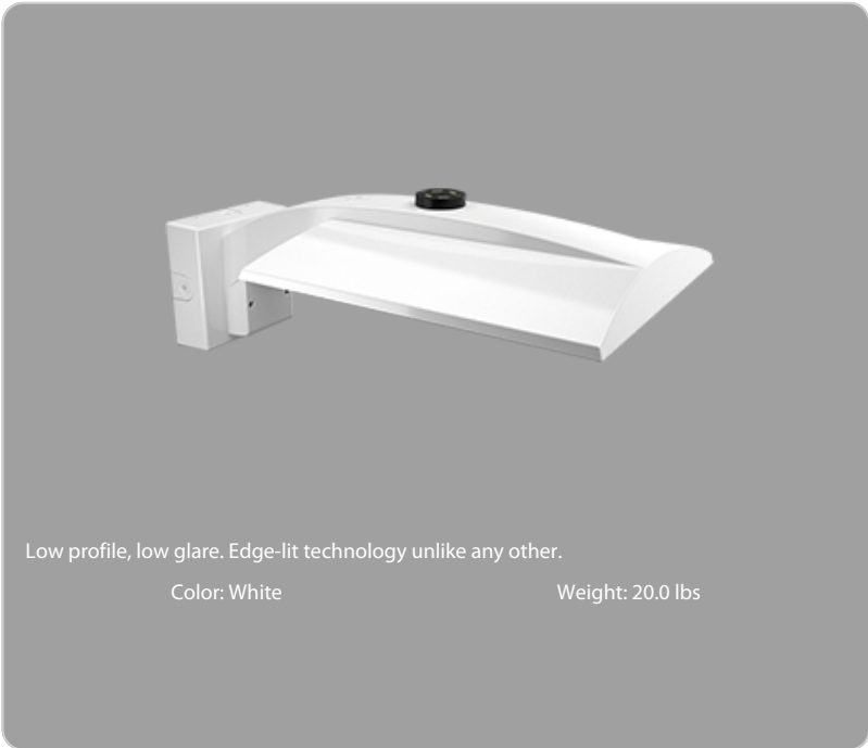
Low profile, low glare. Edge-lit technology unlike any other. Color: White Weight: 20.0 lbs