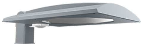
Low profile, low glare. Edge-lit technology unlike any other. Color: Gray Weight: 13.5 lbs