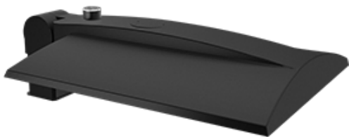
Low profile, low glare. Edge-lit technology unlike any other. Color: Bronze Weight: 13.5 lbs