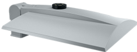
Low profile, low glare. Edge-lit technology unlike any other. Color: Gray Weight: 13.5 lbs