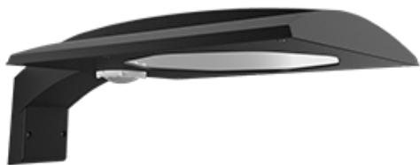
Low profile, low glare. Edge-lit technology unlike any other. Color: Bronze Weight: 15.0 lbs