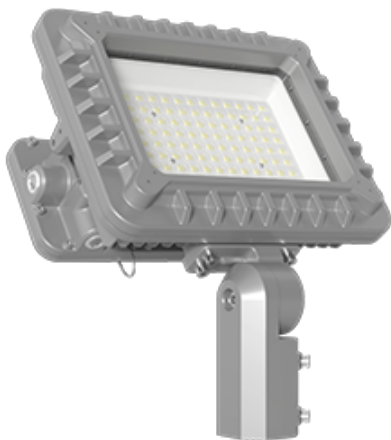
Color: Gray Weight: 38.0 lbs