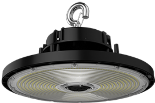
Color: Black Weight: 17.4 lbs