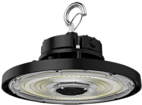
Color: Black Weight: 4.7 lbs