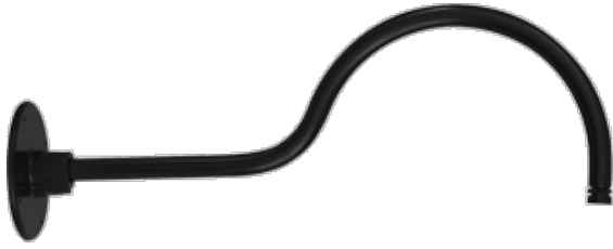
Gooseneck mount for LED Wall pack