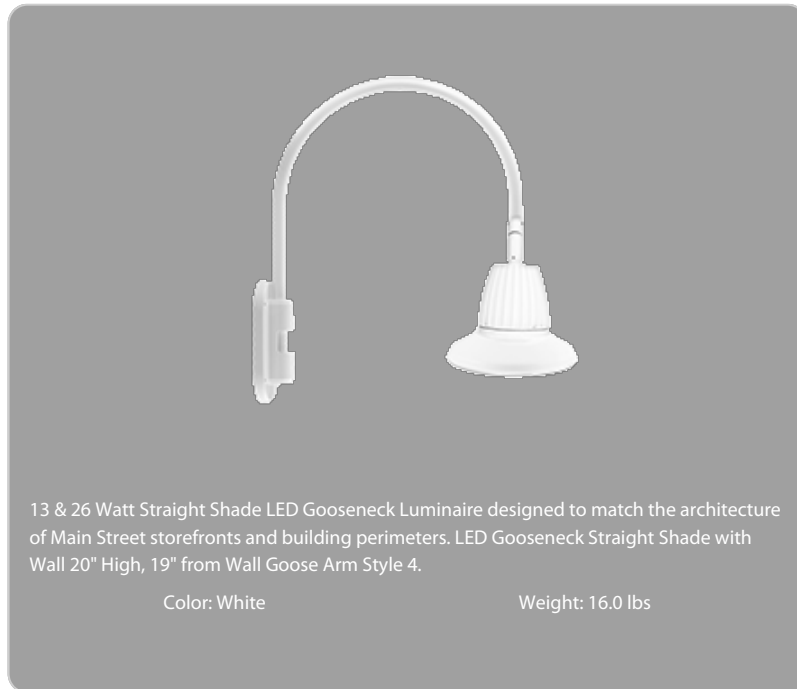
13 & 26 Watt Straight Shade LED Gooseneck Luminaire designed to match the architecture of Main Street storefronts and building perimeters. LED Gooseneck Straight Shade with Wall 20" High, 19" from Wall Goose Arm Style 4.