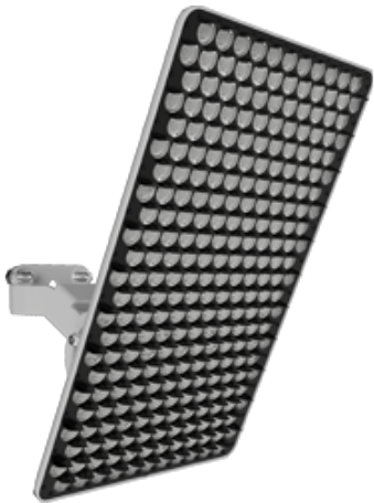
Color: Gray Weight: 37.7 lbs