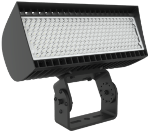
Color: Bronze Weight: 36.8 lbs