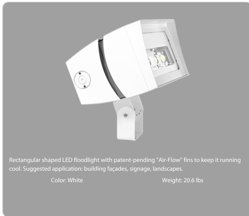
Rectangular shaped LED floodlight with patent-pending "Air-Flow" fins to keep it running cool. Suggested application: building façades, signage, landscapes.